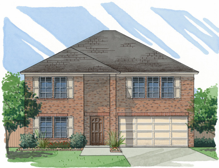
FRONT ELEVATION SCALE: 3/32"=1'-0"