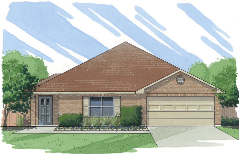
FRONT ELEVATION SCALE: 3/32"=1'-0"

ELEVATION ILLUSTRATED WITH OPTIONAL: BRICK GABLES PORCH RAILING STONE WAINSCOT ADDITIONAL LANDSCAPING