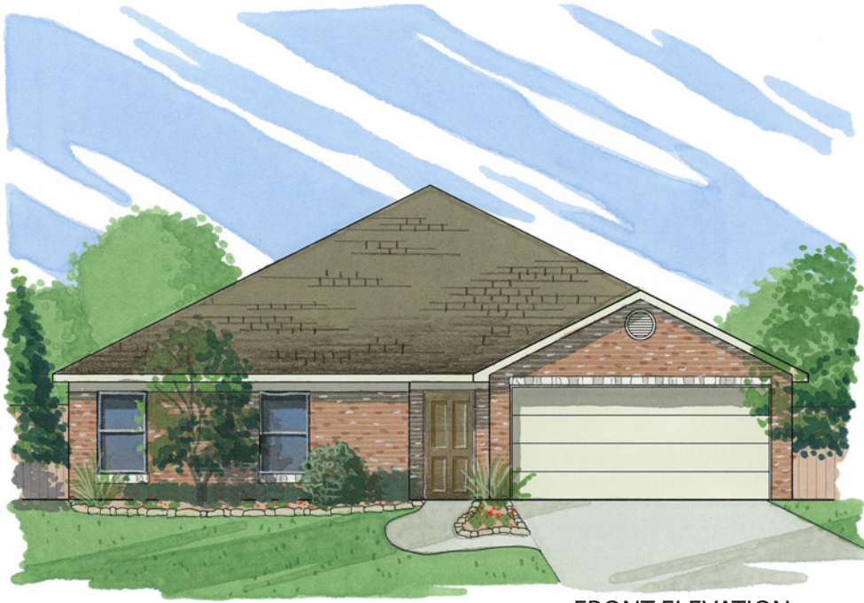
FRONT ELEVATION SCALE: 3/32"=1'-0"

EXCITING FEATURES 4 SPACIOUS BEDROOMS 2 BATHROOMS TWO-CAR AUTO STORAGE WALK-IN CLOSETS PRIVATE MASTER SUITE COMFORTABLE BACK PATIO