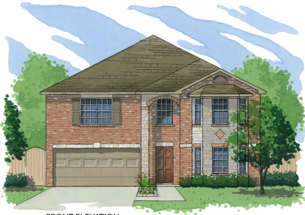
FRONT ELEVATION SCALE: 3/32"=1'-0"

ELEVATION ILLUSTRATED WITH OPTIONAL: STONE ACCENTS & BRICK PATTERN STONE SILLS & HEADERS ADDITIONAL LANDSCAPING