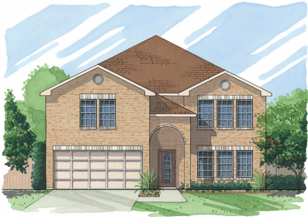
FRONT ELEVATION SCALE: 3/32"=1'-0"